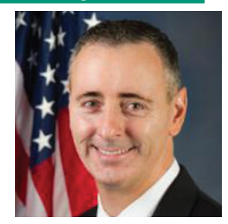
U.S. Rep. Brian Fitzpatrick